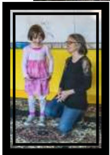
Jokes and poetry readings provided the entertainment.