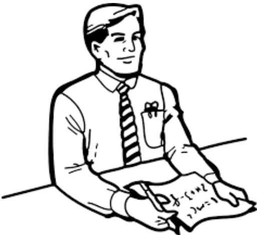
AFN is looking for a secretary and a treasurer to join the board.