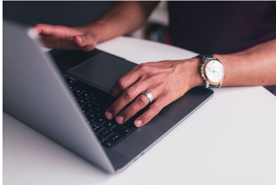
Fill out the forms on our Parent Portal.

This year - for the first time – parents and guardians will fill out the forms from the First Day Packet online.