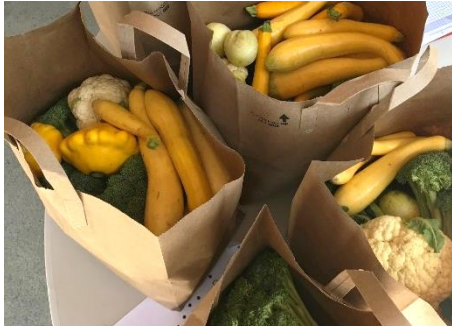
Fresh vegetables were handed out this Monday at Fuente Nueva.

This week we sent home a bag of vegetables to every family who ordered a school meal.