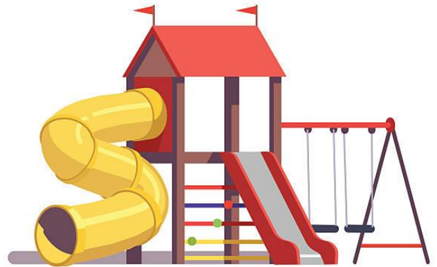
AFN has funded playground equipment, among other things.

Amigos de Fuente Nueva (AFN) – Parent Teacher Organization