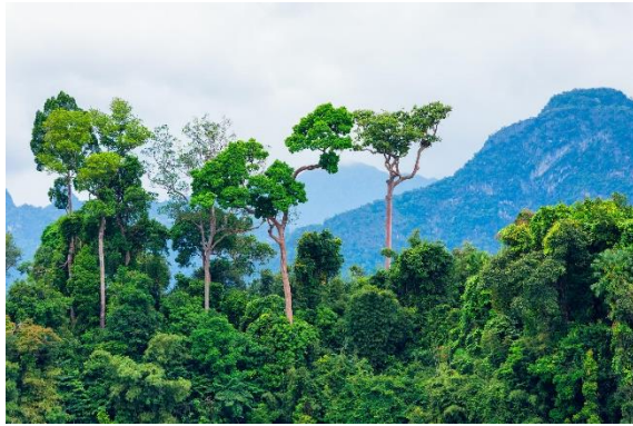
Saving the rainforest is one of the essay topics.

4th graders are beginning to work on expressing their opinions in a persuasive essay on a topic of their choosing.