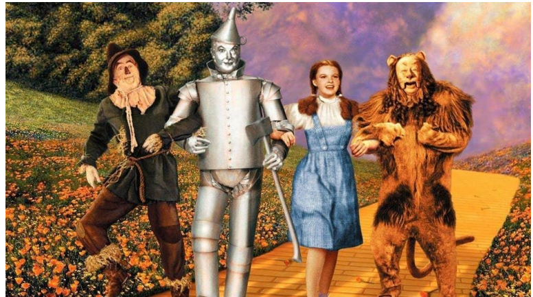
Wizard of Oz is the theme of Reader's Theatre 2020 – on Zoom!

Fourth and fifth graders will be hard at work practicing their lines and meeting in small groups to record their Zoom theater sessions. It is going to be a performance like no other.