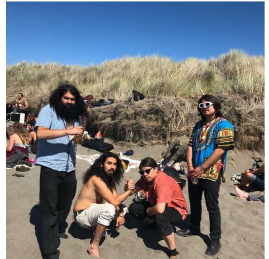
Los Dune Bums is a collective of talented Chicanx musicians, playing surf cumbia.

On page 2 in the newsletter you can see a sneak preview of exclusive staff events that can be won at Fiesta Ball!